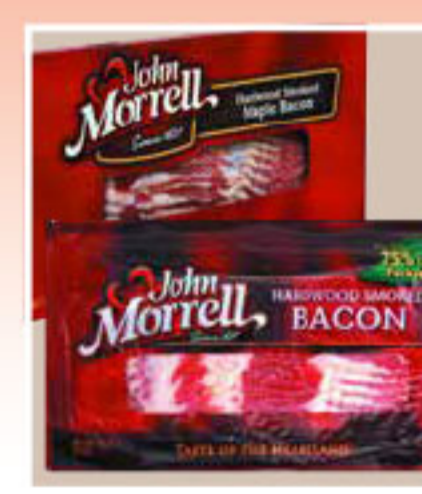
John Morrell Bacon Selected Varieties 12 Oz.