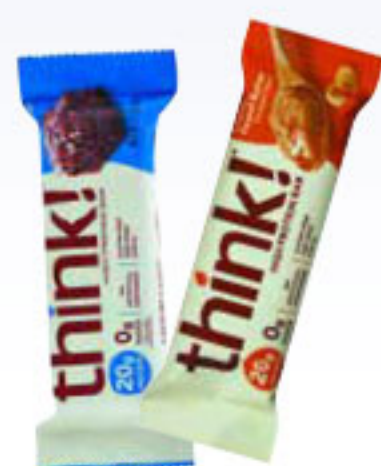
Think! Bars Selected Varieties 1.2 to 2.1 Oz.