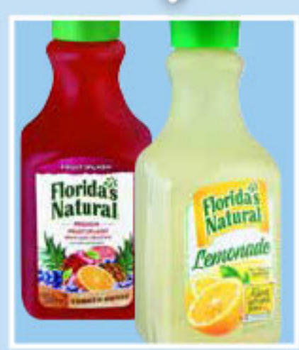
Florida's Natural Lemonade, Peach Mango or Fruit Splash Selected Varieties 59 Oz.