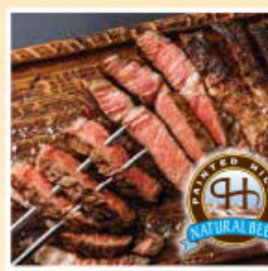
Painted Hills Boneless Beef Top Round Steak Choice or Better