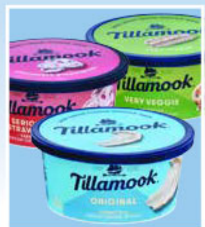
Tillamook Cream Cheese Selected Varieties 7 Oz.