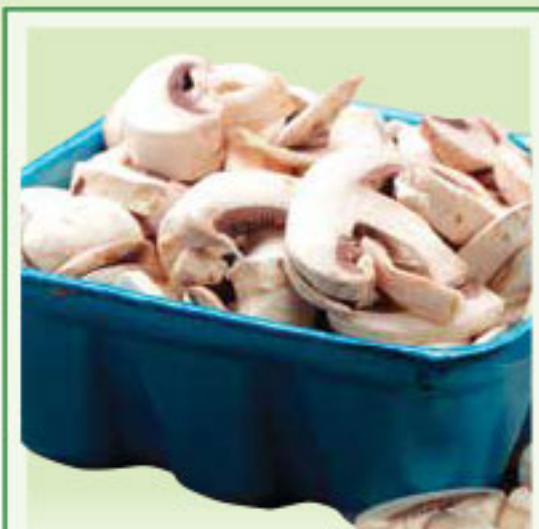
8 Oz. Package Cello Sliced Mushrooms