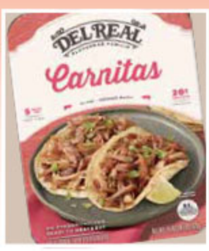
Del Real Mexican Meals Selected Varieties 15 Oz.