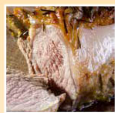
All Natural Pork Rib or Loin Roast Bone-In