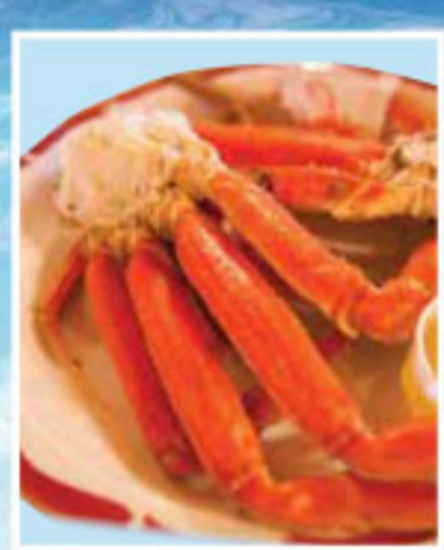
Opilio Snow Crab Clusters Previously Frozen