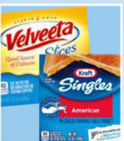
Kraft Singles or Velveeta Slices Selected Varieties 10.7 to 12 Oz.