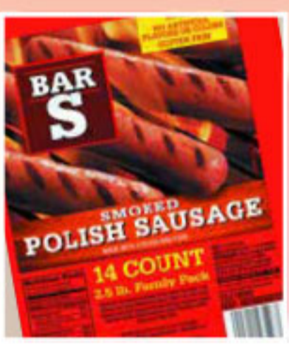
Bar-S Sausage Selected Varieties 2.5 Lb.