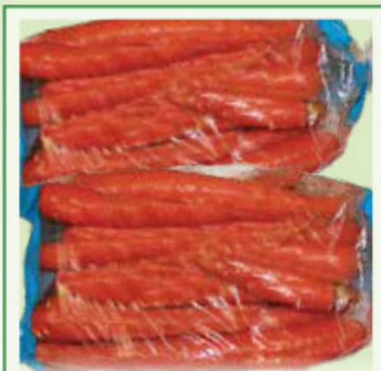
2-lb. Bag Carrots