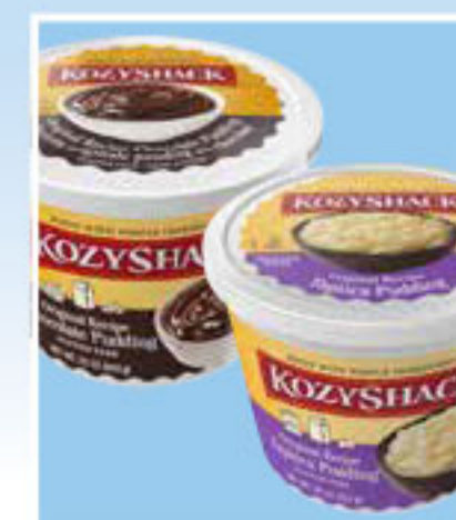
Kozy Shack Pudding Selected Varieties 22 Oz.