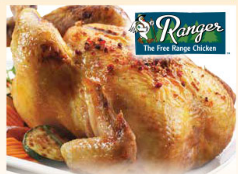
Ranger Free Range Whole Body Chicken