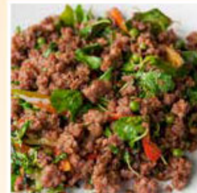
All Natural Ground Pork