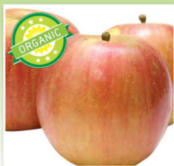
Organic Fuji Apples