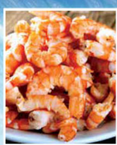
Texas Pink Prawns Previously Frozen 10 to 15 Count