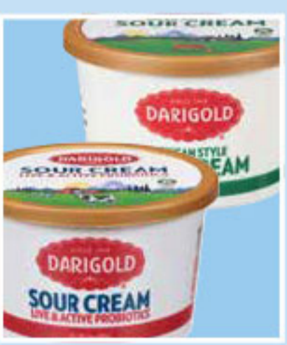
Darigold Sour Cream Original or Mexican Style, 16 Oz.