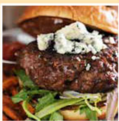
Fresh Extra Lean Ground Beef 16% Fat