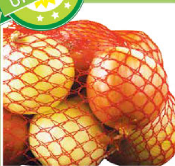
Organic 3-Lb. Bag Yellow Onions