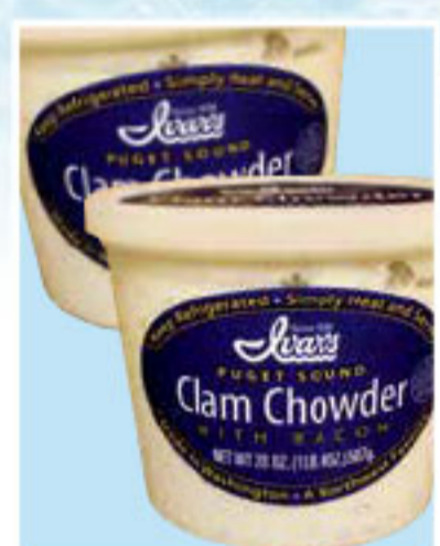
Ivar's Clam Chowder 20 Oz.