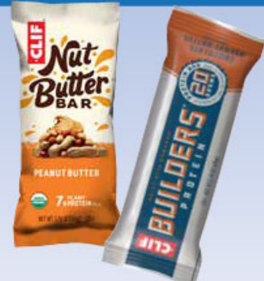
Clif Bar or Builders Bars Selected Varieties 1.76 to 2.4 Oz.