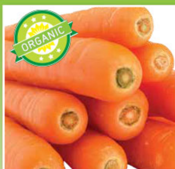
Organic Carrots 2 Lb. Bag