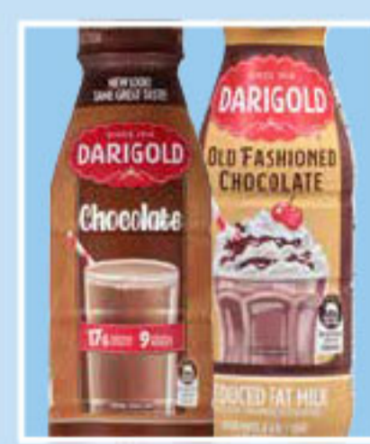
Darigold Single Serve Milk Selected Varieties 14 Oz.