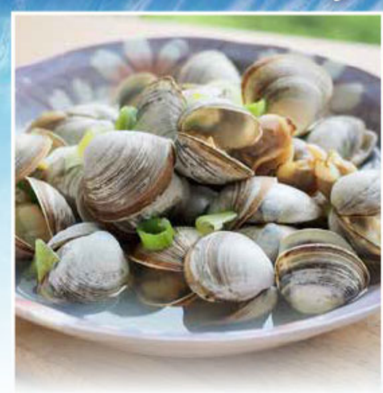
Fresh Manilla Clams Local