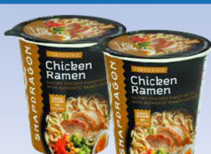
Snapdragon Ramen Selected Varieties 2.2 Oz.