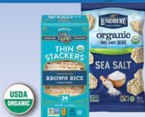
Lundberg Family Farms Organic Rice Cakes or Thin Stackers Selected Varieties 5 Oz.