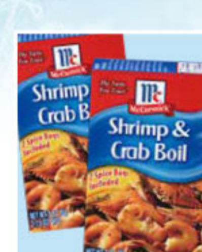
McCormick Shrimp & Crab Boil 3 Oz.