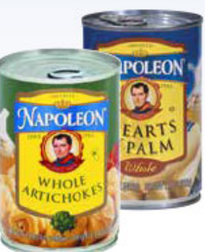
Napoleon Artichokes or Hearts of Palm Selected Varieties 13.75 to 14.1 Oz.