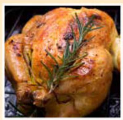
Tyson Premium Cornish Game Hen Frozen, 24 Oz.