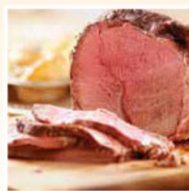
Boneless Beef Cross Rib Roast