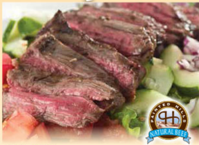
Painted Hills Boneless Beef London Broil USDA Choice or Better