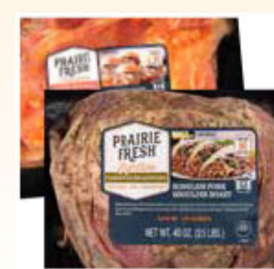
Prairie Fresh Seasoned Boneless Pork Shoulder Roast Selected Varieties 40 Oz.