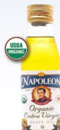
Napoleon Organic Extra Virgin Olive Oil 8.5 Oz.